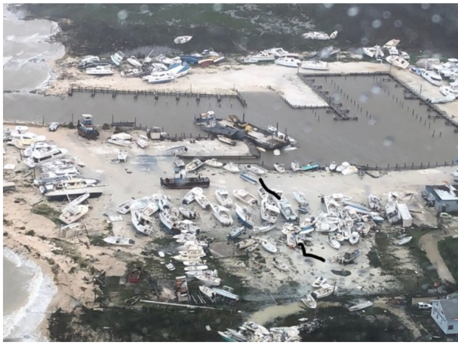
Photo of destruction caused by Dorian.

"We've also been looking for a backup generator, but haven't had any luck