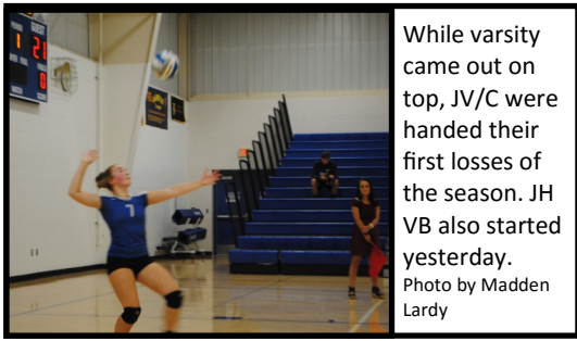
While varsity came out on top, JV/C were handed their first losses of the season. JH VB also started yesterday.